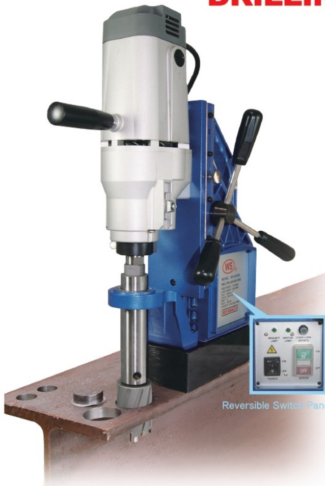
Reversible Switch Panel.