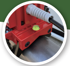
V Sharped Fixed Base