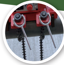
Chain Lock Handle